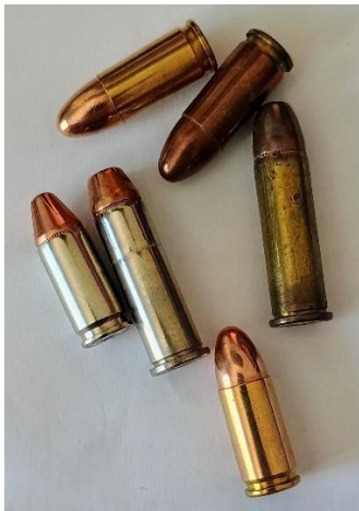
Bullets for the soldiers' weapon

What tools are in your pocket that will help to either plant, water, or harvest the Gospel